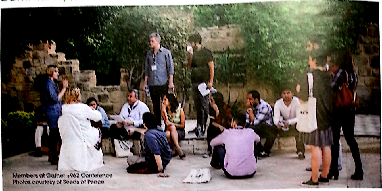
Members at Gather +962 Conference